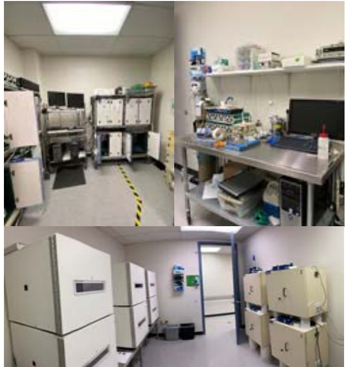
Example Specialty Housing Rooms

With this number of rooms Melior is able to schedule and perform many complimentary procedures in parallel thereby reducing lead time for our clients and maximize in facility efficiency.