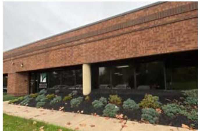
Outside View of the Facility

Melior moved to this site in June 2006. At the time it was only a 8,116-sq. ft. facility. Prior to that, the building was mostly unfinished shell space, that Melior specifically customized for its use. In 2008, Melior expanded into an additional 5,394-sq.ft. of space. In November 2020 the Company added an additional 4,689 sq.ft. In January 2023 the Company added an additional 3,895 sq. ft.