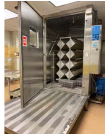
Caging Racks and Cash Washer

The animal facility is managed and maintained by a Vivarium Manager and staff, with support from research investigators. Oversight of the facility and program is through an Institutional Animal Care and Use Committee (IACUC) and one on-call veterinarian.